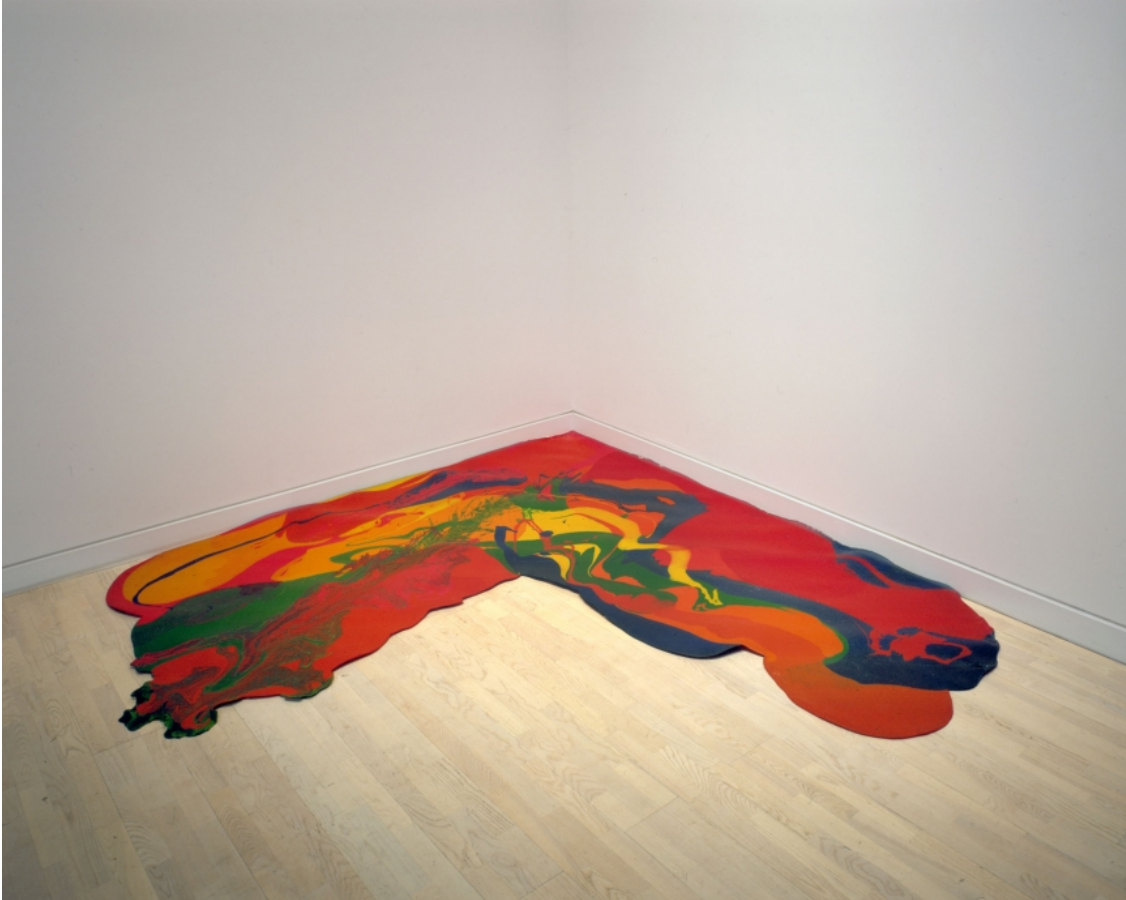
Lynda Benglis Corner Piece , 1969 Poured pigmented latex 125 x 120 inches