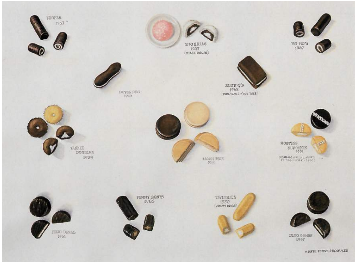
Julie Bozzi Classic Snack Cakes from American Food, 1991 Gouache on paper 17 x 22 inches Collection of the Modern Art Museum of Fort Worth, Museum purchase © Julie Bozzi