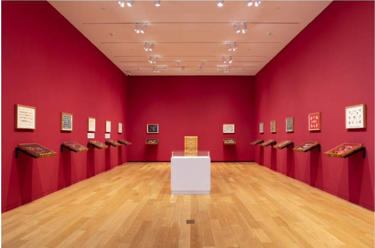
Julie Bozzi American Food , 1980–1992 Cabinet: Oak cabinet with twelve drawers and one index tray Drawings: Various media on paper Collection of the Modern Art Museum of Fort Worth, Museum purchase © Julie Bozzi