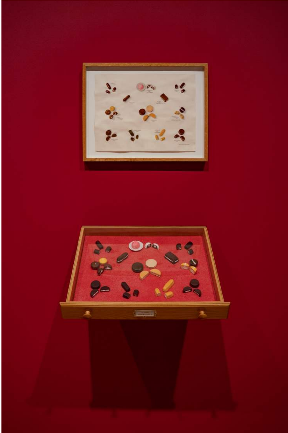
Julie Bozzi Classic Snack Cakes from American Food , 1980–92 (installation view) Gouache on paper and oil and acrylic low-fire white clay and plaster mounted on enameled wood case Collection of the Modern Art Museum of Fort Worth, Museum purchase © Julie Bozzi