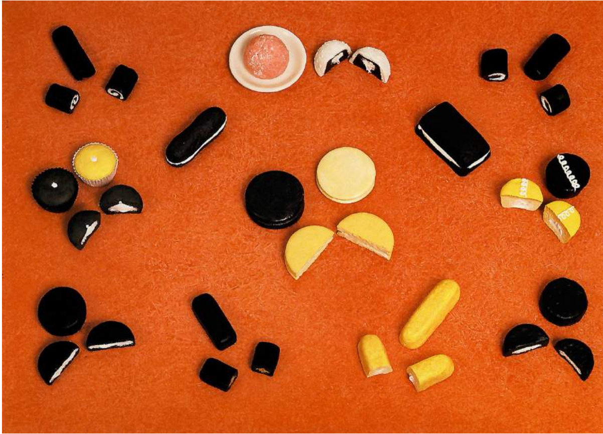
Julie Bozzi Classic Snack Cakes from American Food , 1991 Oil and acrylic on low-fire white clay and plaster mounted on enameled wood base 27 x 50 x 22 inches Collection of the Modern Art Museum of Fort Worth, Museum purchase © Julie Bozzi