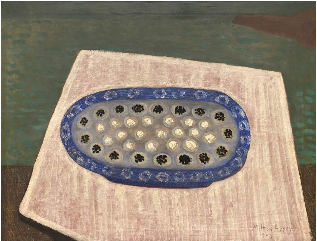
Milton Avery Hors d'Oeuvres , 1943 Oil on canvas 28 x 36 inches Private Collection

Does a serving dish of hors d'oeuvres awaiting interaction intrigue you?