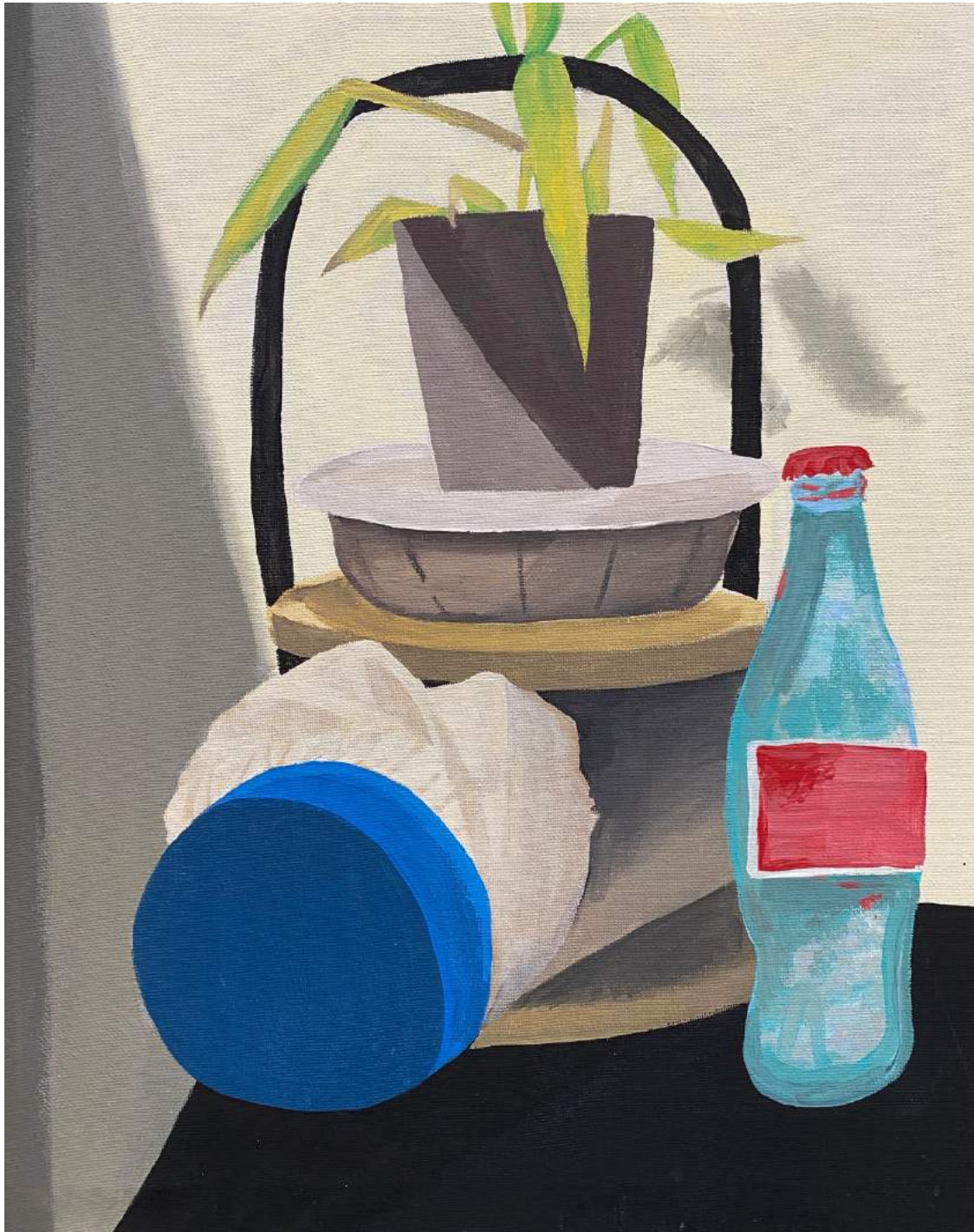
Ariana Rojas Untitled, 2021 Acrylic on canvas 14 x 18 inches

Did a still life accidentally emerge as you were rearranging space?