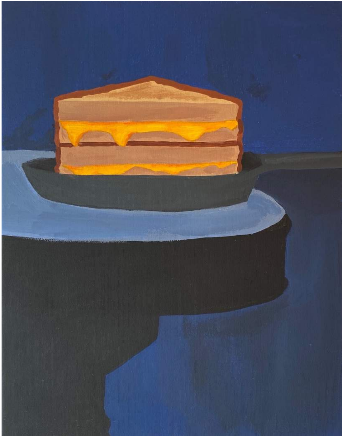
Ariana Rojas Untitled , 2021 Acrylic on canvas 11 x 14 inches

Should a grilled cheese sandwich be plated and served on a cast iron skillet?