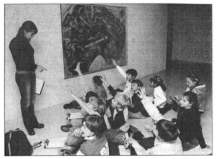
Figure 1: Third-grade students on a tour of the Guggenheim Museum.